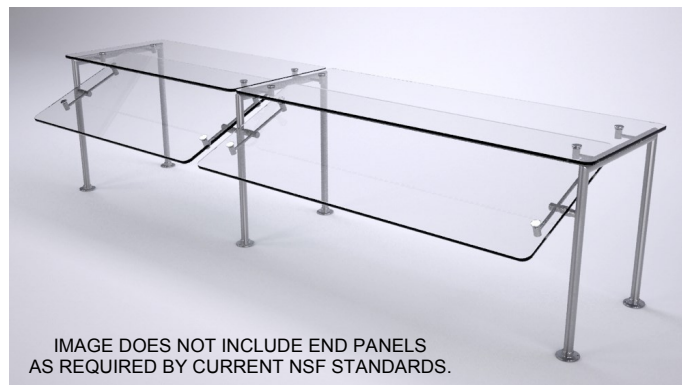
IMAGE DOES NOT INCLUDE END PANELS AS REQUIRED BY CURRENT NSF STANDARDS.

As required by current NSF / ANSI 2 standards, all food shields will be quoted with side end panels unless customer requests otherwise. Standards available upon request.